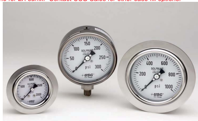
Figure 3: Model 659 Family