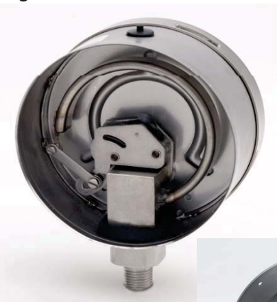
Figure 2: Model 659 with METEK M&G Type EW Diaphragm Seal